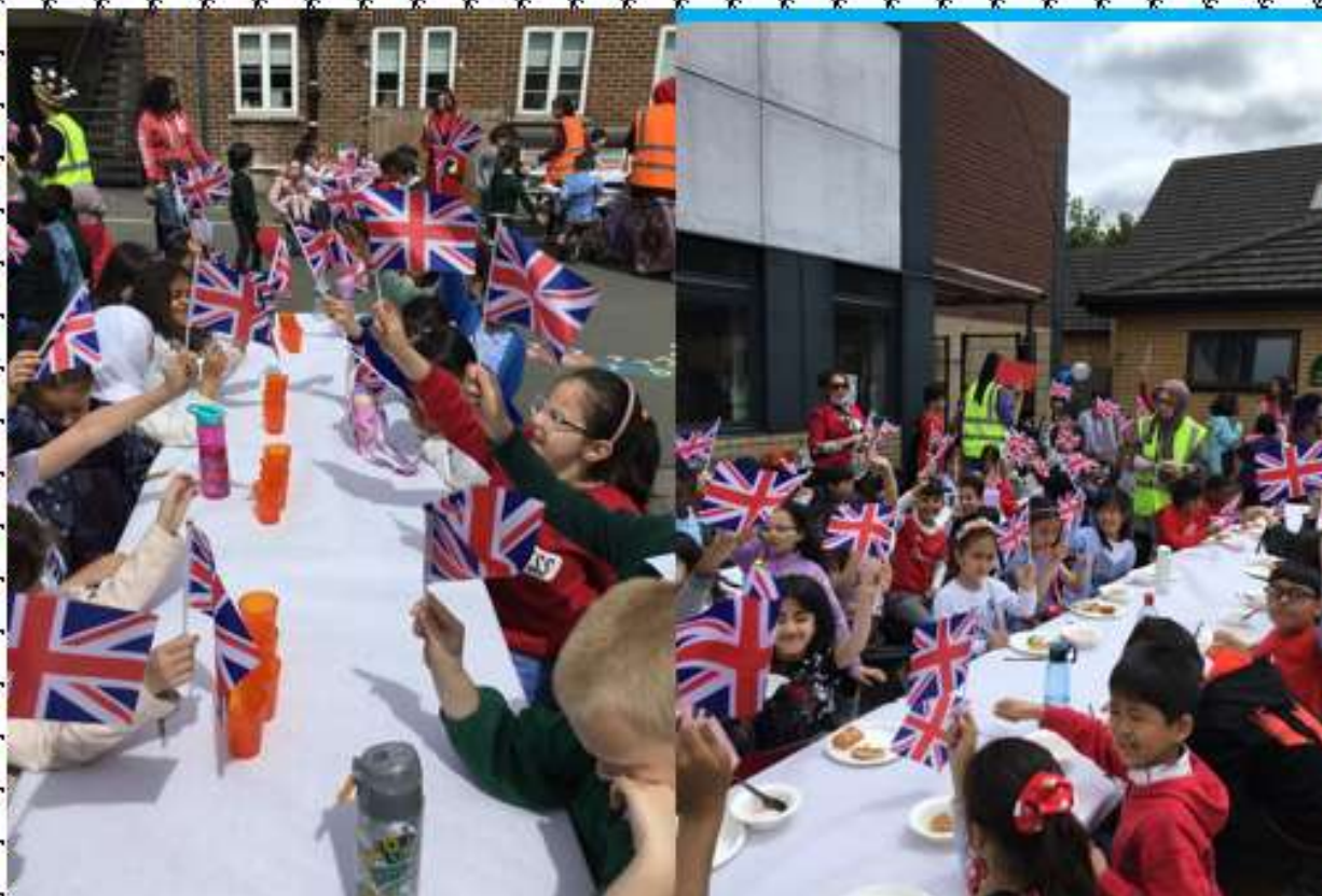
Our very own Jubilee Lunch Street Party!