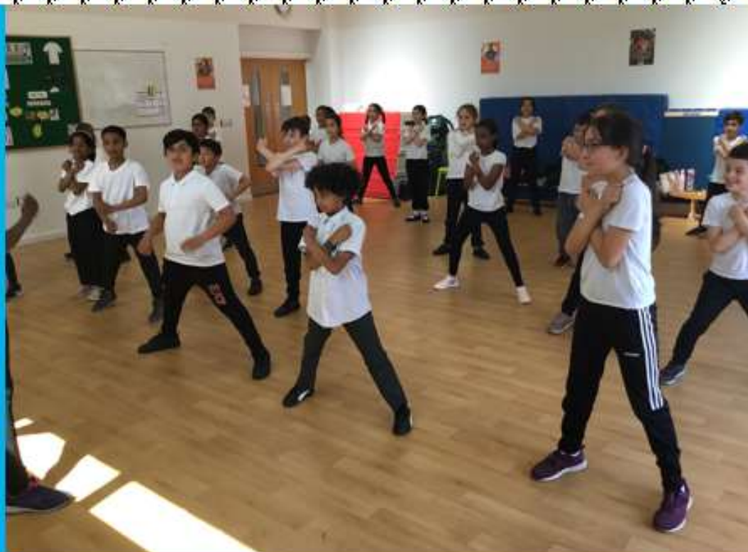
Dances from around the Commonwealth!