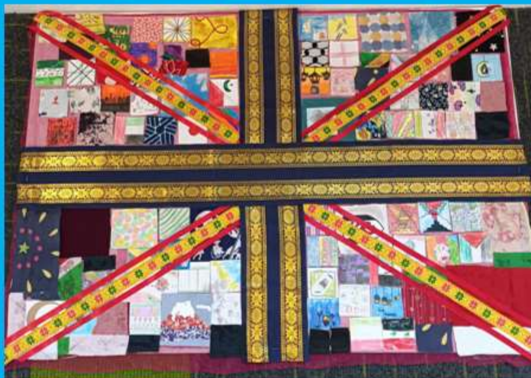
The West Acton New Union Jack!